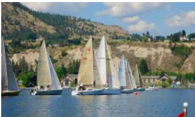
Colourful start last year's Regatta

The most spectacular part of the race is the start when all the boats hit the starting line as the horn sounds to start the race. Power boaters and non-competing sailors are usually out in full force with their cameras to witness this.