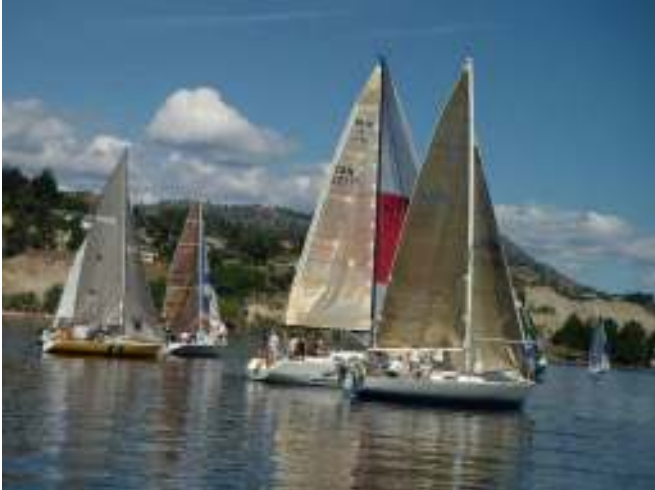
The becalmed start to the race.