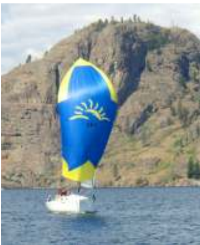
Coming home on Saturday