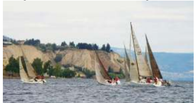
Better wind on Sunday

We all win in this event because of our affiliation with Agur Lake. At the end of the day we, the sailors, get to go out and fulfill our passion for sailing, while at the same time raising funds for a